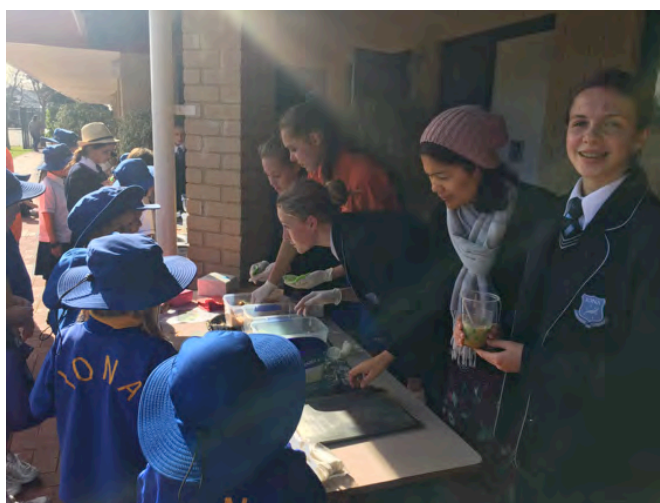
Cake stall at lunch time – Year 9 Indonesian language students baked a variety of Indonesian cakes for our cake stall. They joined us to celebrate the day and to sell the cakes they baked.