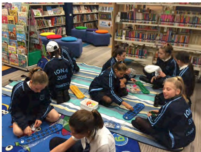
Recess games – Indonesian traditional game 'Congkak' played in the library.