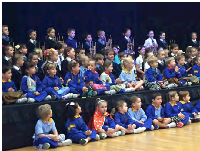
Assembly Item – 'Cicak di Dinding' (Gecko on the wall) song performed by the Pre-Primary, Year 1, 2 and 3 students. Year 3 students played the 'Angklung' percussion instrument.